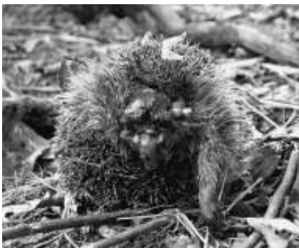
Hedgehog 234, found with head bitten off on the day after release. Probably killed by a dog as it was found in an area frequented by dog-walkers.

The radio-tracking was carried out using a TRX-1000S receiver (Wildlife Materials Inc, Illinois, USA) and a Folding 3-Element Yagi Directional Antenna. Daytime resting sites were identified, mainly to assist the evening work, as they indicated whether the hedgehogs had moved substantial distances since the last time they were located. At night the position of each hedgehog was noted and its position recorded as six-digit coordinates taken from a 1:10,000 OS map. Each animal was weighed at each capture using a 'Pesola' spring balance (weighing to 1000 g, with 10 g divisions), giving an indication of general body condition and confirming that the animals were or were not maintaining their weight by successful feeding. Body mass was taken to be the clearest indication of general health and the ability to thrive. If the animals were failing to thrive in