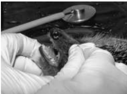
During the health check, conducted on the hedgehogs while unconscious, the state of their teeth was checked.

Our objective is to test the claim that translo-