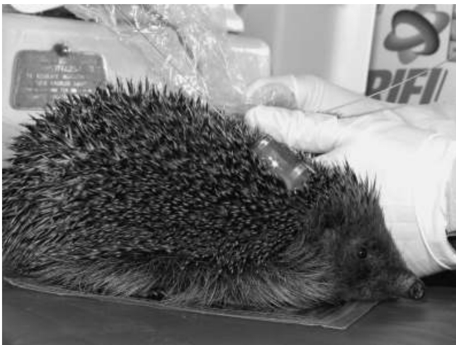
The radio-transmitters were applied to the hedgehogs while they were still unconscious, following their health check. They were kept warm on heating pads and held firmly as they awoke to allow the glue to set.

While the hedgehogs were unconscious for the health check a radio transmitter ('Biotrack', Wareham, Dorset, weight 10 g) was attached. A small group of spines on the back of the hedgehog were clipped to create a flat bed, on to which the transmitter was glued using epoxy resin applied to the front and sides of the transmitter. The glue did not touch the animal's skin, the points of attachment being the uncut spines surrounding the transmitter. The transmitter's unique radio frequency became the animal's identity number used in this paper.