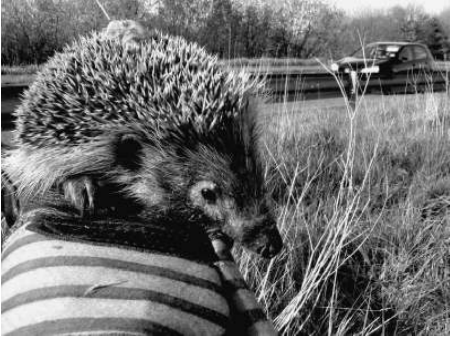
Hedgehog 385 by a very busy road. It was disturbed in the day to check that the signal was not coming from a corpse.

than about 550 g should not be released without a period of fattening up in captivity.