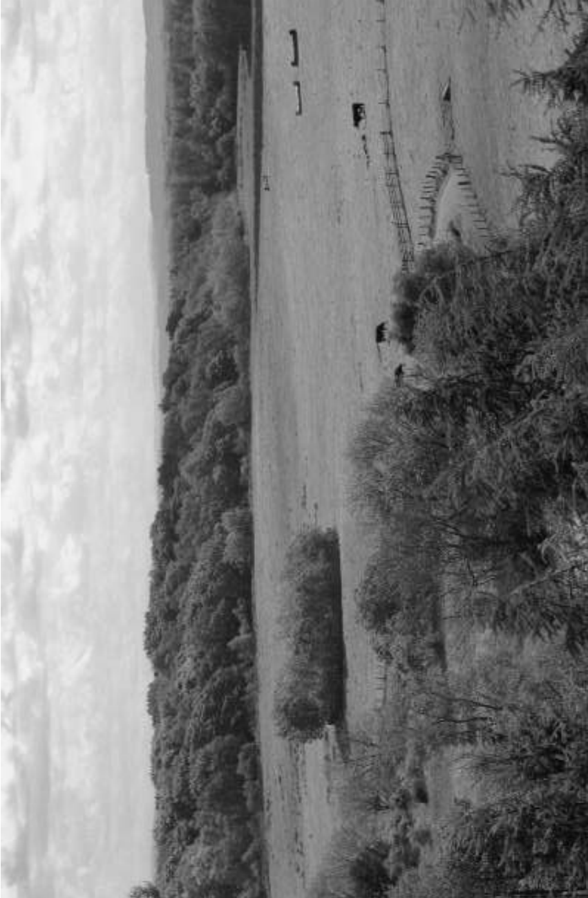
Eglinton Country Park, in which the Uists hedgehogs were released.